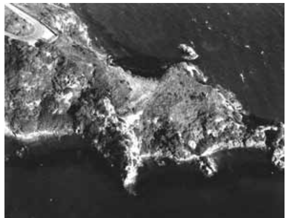
Te Moana-a-kura Pā