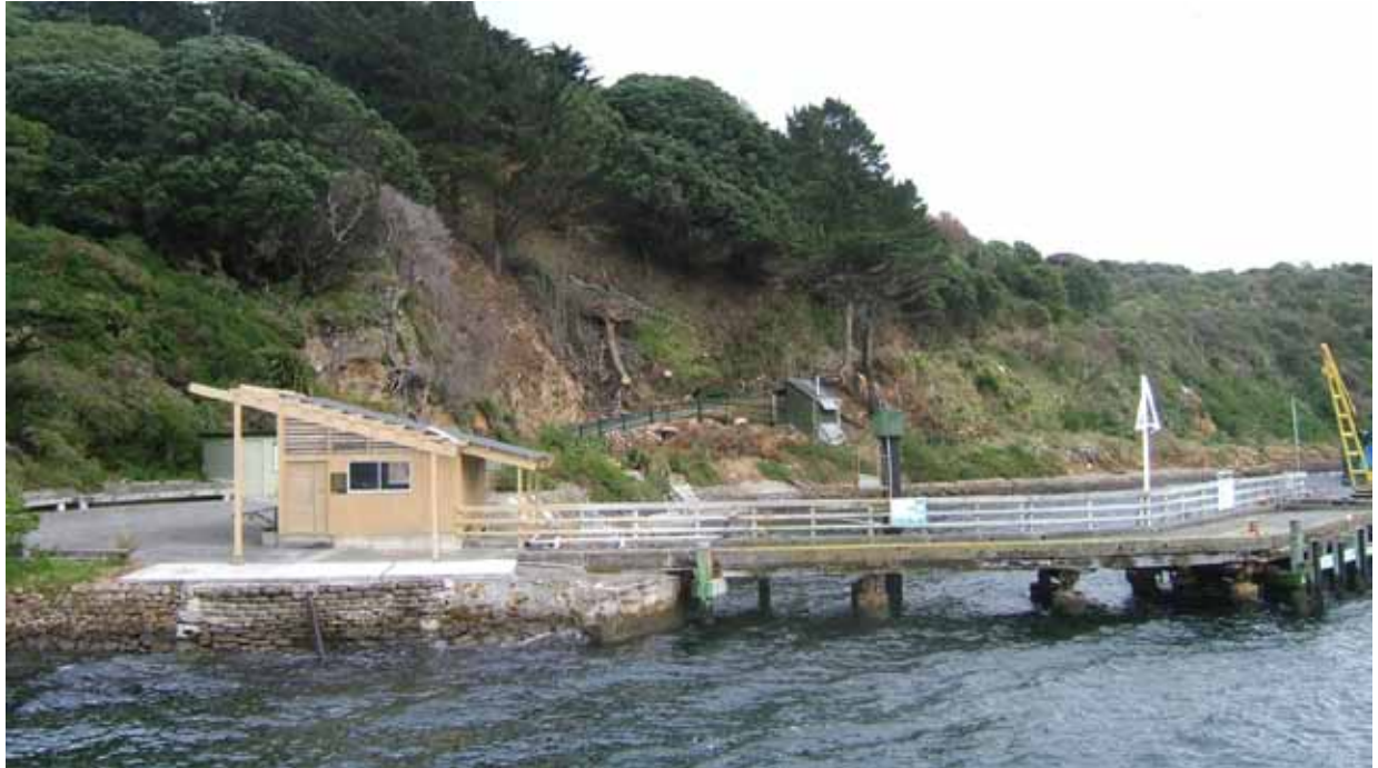
Current entry point to Mātiu/Somes island with Whare Kiore/bag checkpoint and wharf.